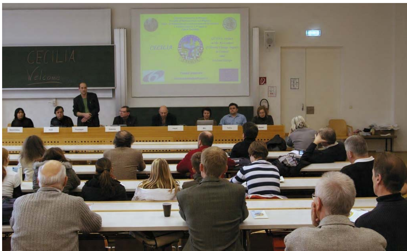
Fig. 1 Meeting with endusers in Vienna, 31 st January 2007 – project introduction

The official part of the meeting lasted about two hours and it was followed by an informal debate outside the lecture room.