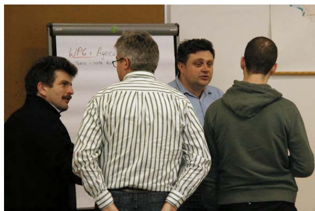
Fig. 2 Meeting with endusers in Vienna, 31 st January 2007 – discussion with workpackage leaders